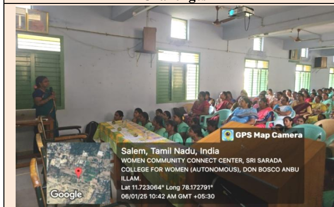
Empowering Research Excellence: Exploring Mobile Apps, Plagiarism Prevention and AI Tools for Innovation