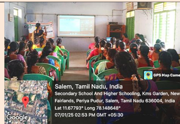
Need of Intellectual Property Rights and Its Importance for Innovators and Entrepreneurs