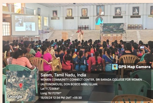
Experiences on International Research